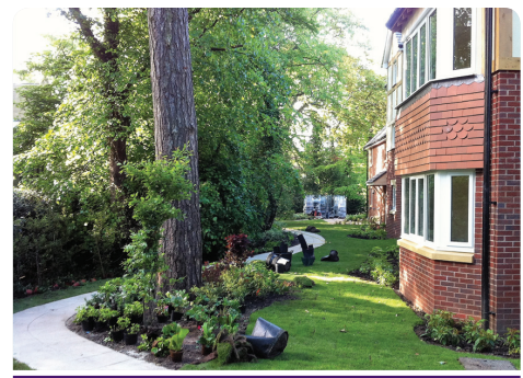
Steeple Lodge, Sutton Coldfield: This site was originally an old vicarage set in a mature garden with a thick boundary belt of mature broadleaved trees. Read more