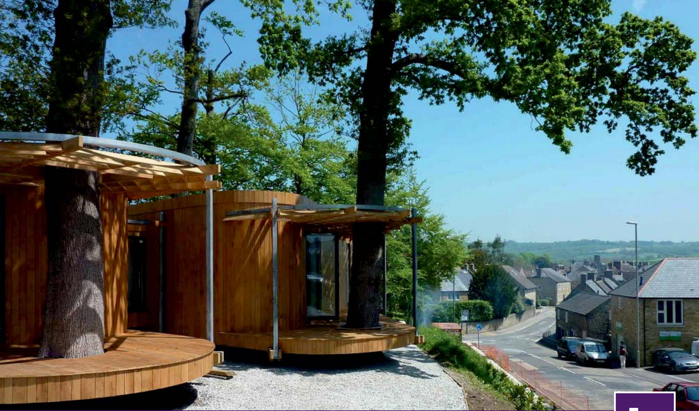
The Lodge, Clay Lane, Beaminster, Dorset